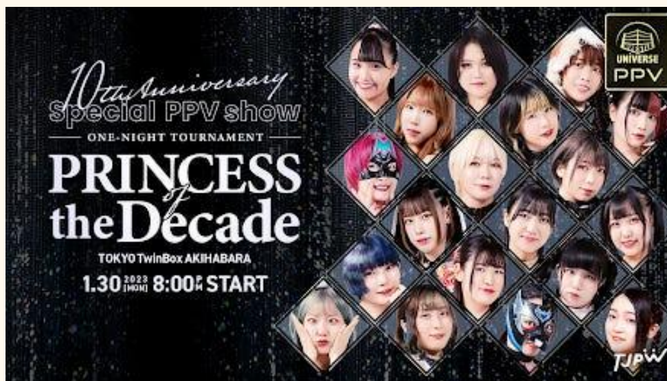
Beyond the Origins, Into the Future